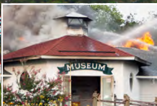
Deltaville Maritime Museum To Rebuild