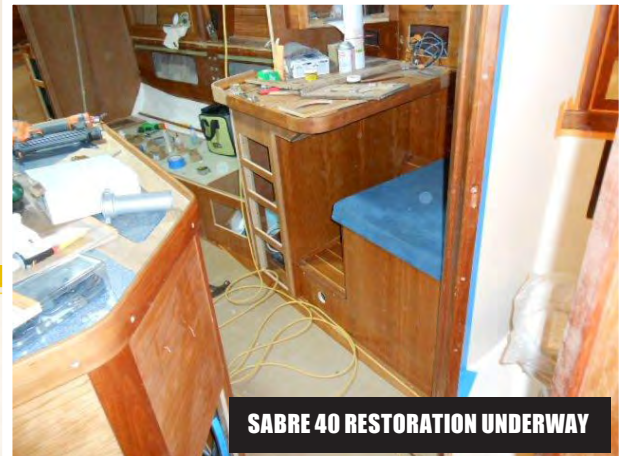
SABRE 40 RESTORATION UNDERWAY