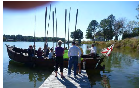
Join the newly formed John Smith's "Explorer Society". Learn 1600's boating techniques.

11 th -Friday, 5-8pm, Artists Wine & cheese preview 12th- Saturday: 10 AM-4 PM. Holly Point Art & Seafood Festival, Artists, Car Show, Pierwalk displays, seafood at Billz Bistro, food court, free creek cruises & Pirates Abound. "Best Little Festival on the Peninsula"