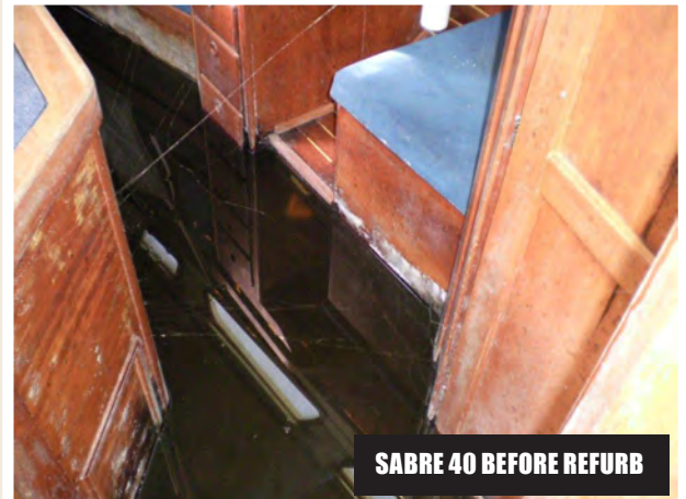
SABRE 40 BEFORE REFURB