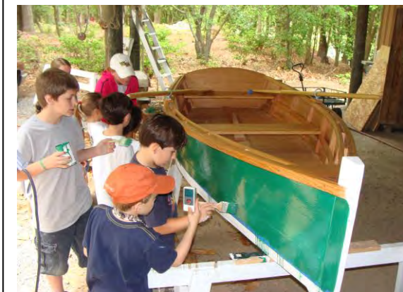
Family Boatbuilding Week, finishing touches

22nd - Saturday Farmers' Market 9am-1pm, Billz Bistro opens at 8 for breakfast! Groovin' in the Park. 6-8pm, TBA. They'll be great!