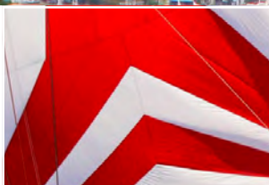
Updates from DYC Cruisers