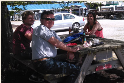
LUNCH AT DYC DEALER DAYS