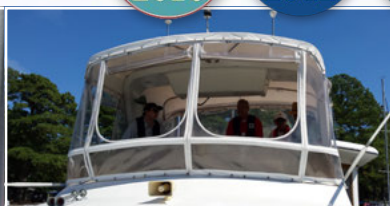
Boaters' Boot Camp