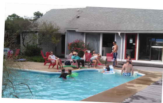
Labor Day Fun at DYC