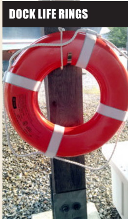
DOCK LIFE RINGS

* Help us keep DYC Waters clean and safe by obeying the 'NO SWIMMING IN MARINA BASIN' signs. Swimming in any marina basin can be hazardous due to the potential of underwater objects, moving vessels and stray electrical currents.