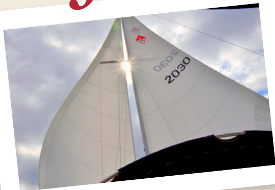
Downwind view on Catalina 36 "Reiblekate" w/Peyton & Denise Kash