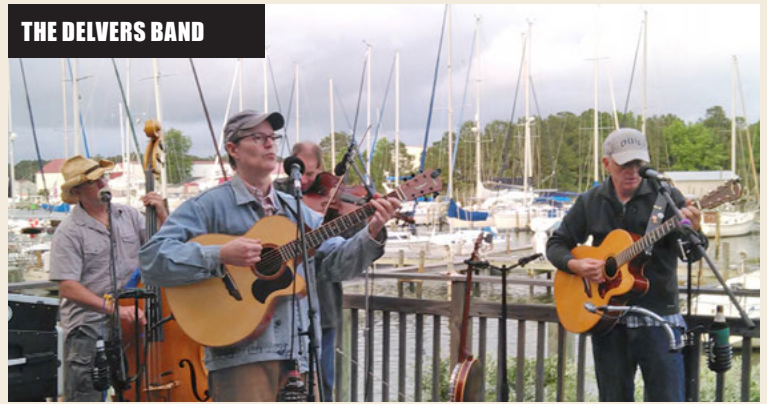
THE DELVERS BAND