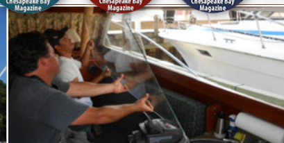
DYC Service Work