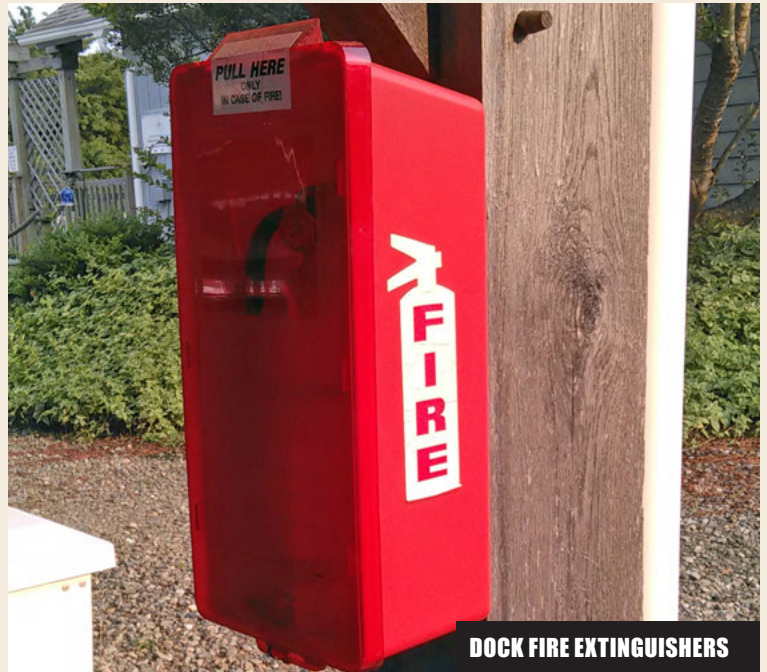
DOCK FIRE EXTINGUISHERS

* Diagrams of DYC docks are posted in all public bathrooms, showing locations of dock ladders & fire extinguishers.