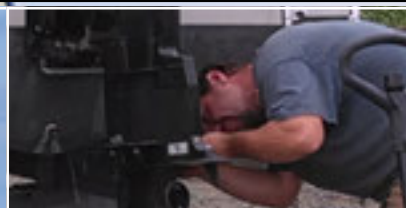
DYC Service Busy