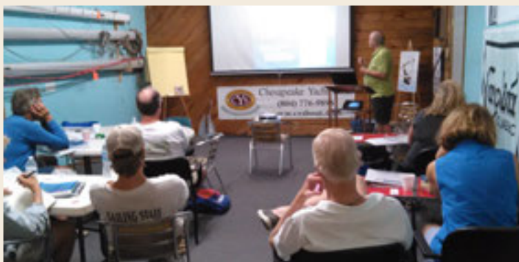
BOATERS' CLASSROOM TRAINING