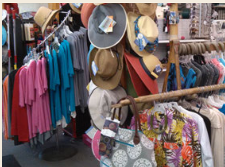
CLOTHING WITH A BOATING ATTITUDE