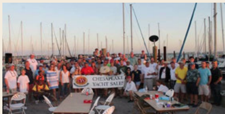
SUNFISH CHALLENGE THANKS CHESAPEAKE YACHT SALES