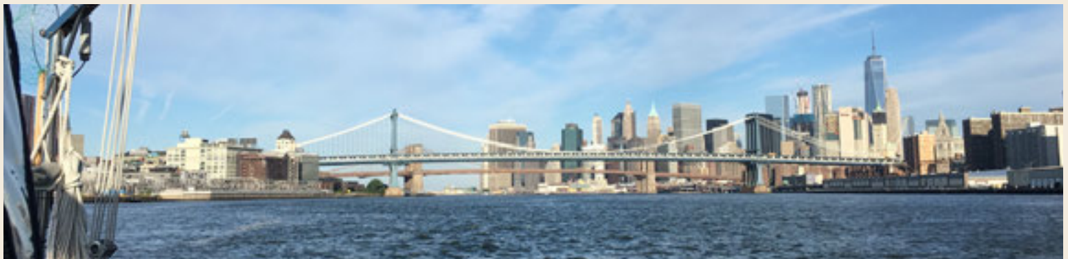
BELLIE LAUGHIN AT BROOKLYN BRIDGE & MANHATTAN BRIDGE