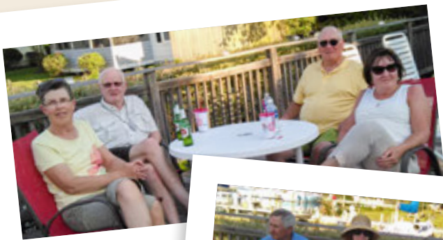
Relaxing Boaters' Party