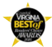
Readers Choice 2016