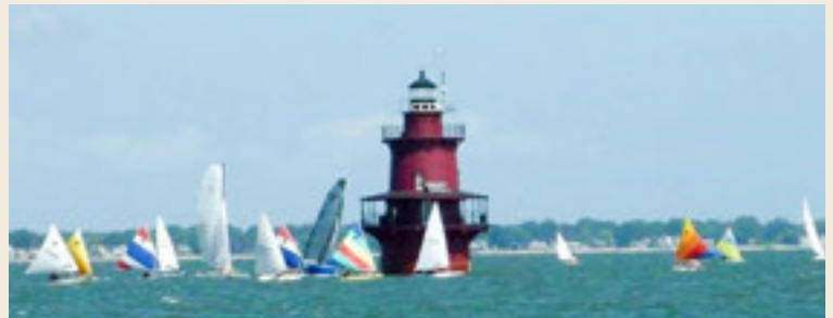
SUNFISH CHALLENGE 2016 AT THIMBLE SHOALS LIGHT