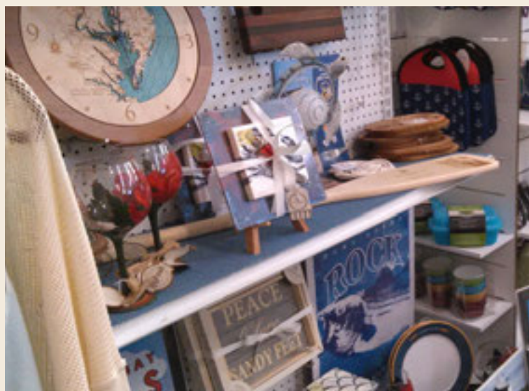
GIFTS & BOAT AWAY FROM HOME DÉCOR

Come Shop for Christmas Gifts (and pick up a boat part while you're here ... to make Lew Grimm happy too!)