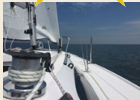
FIRST SAIL ON 2017 CATALINA CAPRI 22