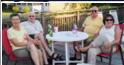
Faces of Boating