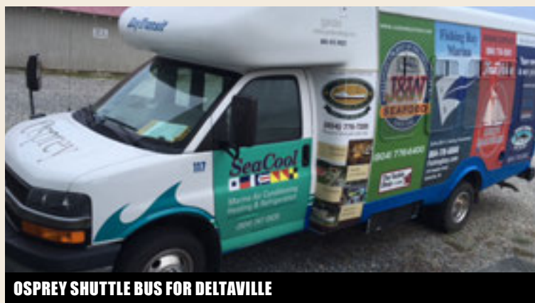
OSPREY SHUTTLE BUS FOR DELTAVILLE

Boaters and locals enjoyed the Summer Shuttle Bus which ran from Memorial Day to Labor Day each weekend in 2016. The great news is that in 2017 this wonderful addition to Deltaville WILL CONTINUE! Local businesses and community groups provided financial support for this this local 1 hour loop public transportation around Deltaville, allowing riders to pay only .50 cents per ride. With 20 stops in addition to 'flag stops' wherever you needed, this service has been well used. We hope for a slightly expanded schedule in 2017, so be sure to GET ONBOARD THE 'OSPREY' DELTAVILLE SHUTTLE BUS next summer when you come to DYC.