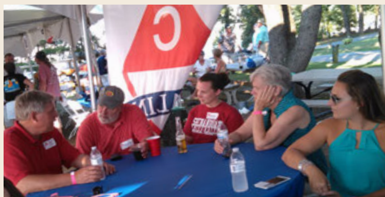
CATALINA EAST COAST RENDEZVOUS 2016