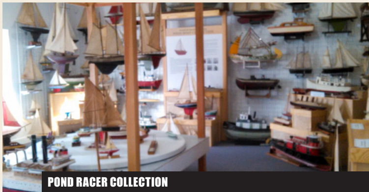
POND RACER COLLECTION