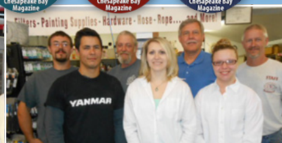
Learning How to Serve You Better