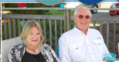
Faces of Boating