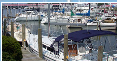
Deltaville Dealer Days Boat Show