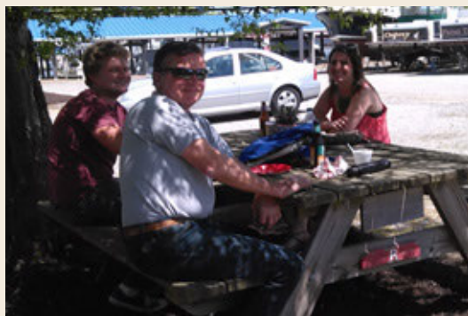
LUNCH AT DYC DEALER DAYS