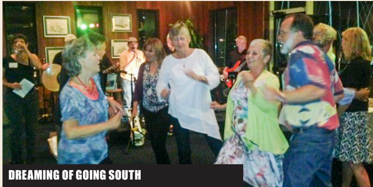
DREAMING OF GOING SOUTH

‘Boaters of a feather’ flock together.....Don’t miss out on this opportunity to gather information for future cruising .....or if this is the year you are heading south. The Hampton Snowbird Rendezvous is well organized and well attended. Registration begins early. For complete details of seminars and social events for 2016 Snowbird Rendezvous, visit www.hamptonrendezvous.com ↓