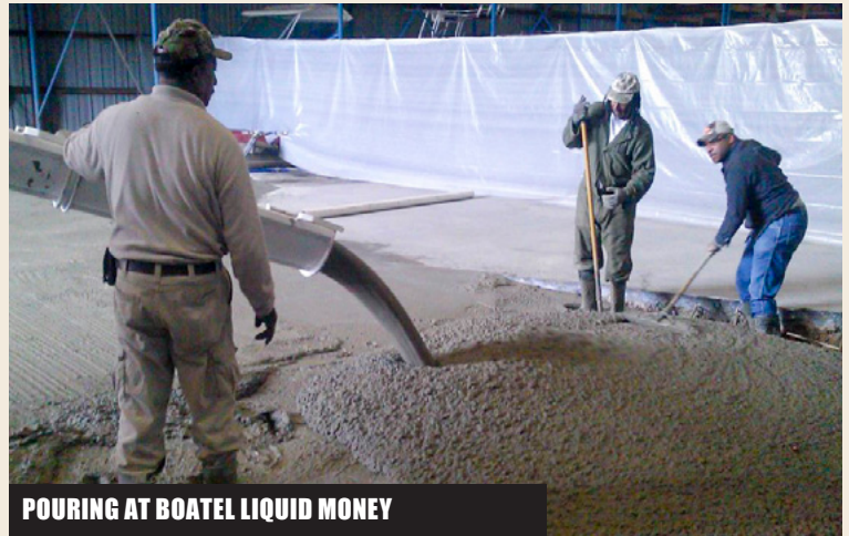
POURING AT BOATEL LIQUID MONEY

Some of the improvements at DYC are ‘out of sight’. All DYC Boatel customer know that they are not allowed ‘inside’ the boatel. However, the floor of the boatel provides the foundation for all forklift ‘in & out’ transport of boaters’ vessels. One of the DYC projects this winter was a pricey floor refurb inside the Boatel, which should help provide for cleaner storage. We thank you for your continued use of the DYC Boatel, which is the most popular in the middle Bay! ↓