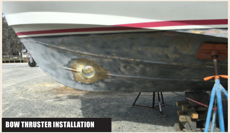
BOW THRUSTER INSTALLATION