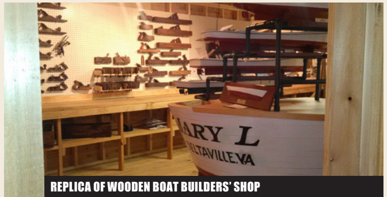
REPLICA OF WOODEN BOAT BUILDERS' SHOP