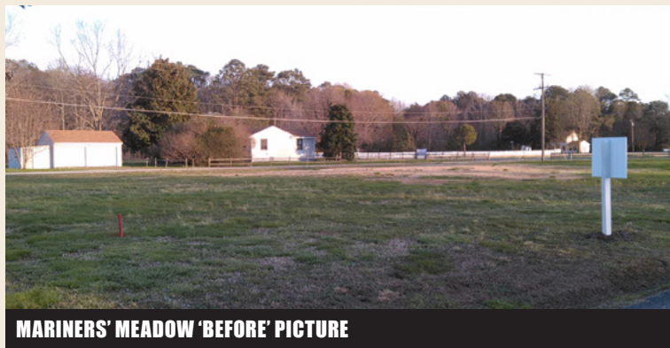
MARINERS' MEADOW 'BEFORE' PICTURE