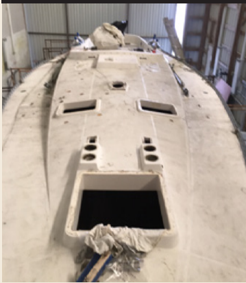
TOP SIDES CORE WORK & PAINT