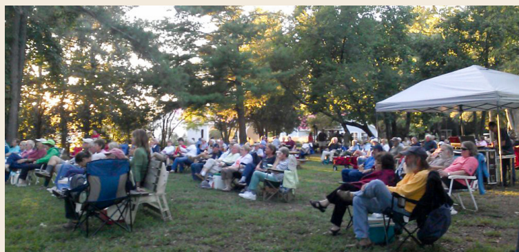
BLUEGRASS BAND, RECKLESSLY ABANDONED AT MARITIME MUSEUM

Check out the website of the Deltaville Maritime Museum & Holly Point Nature Park www.deltavillemuseum.com for updates of 2015 concerts in the park, farmers' markets and family events.