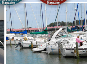
Winterization Before It's Too Cold