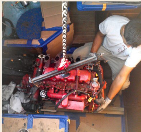
DYC BEGINS SABRE 38 REPOWER