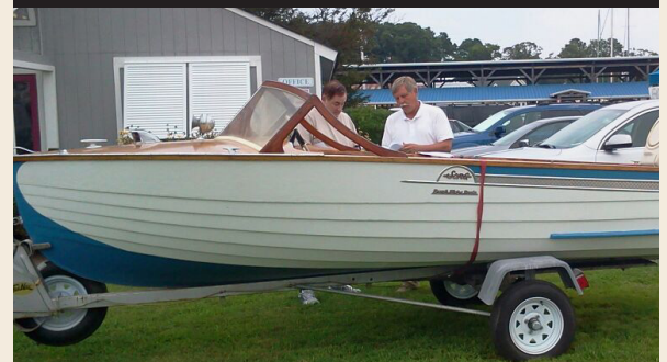
WOODEN CLASSIC 1959 SORG RESTORED BY DYC