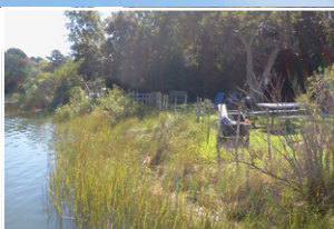
DYC Shoreline Clean Up