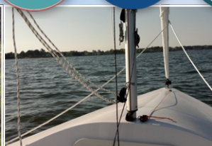
2015 DYC Sailing Seminar