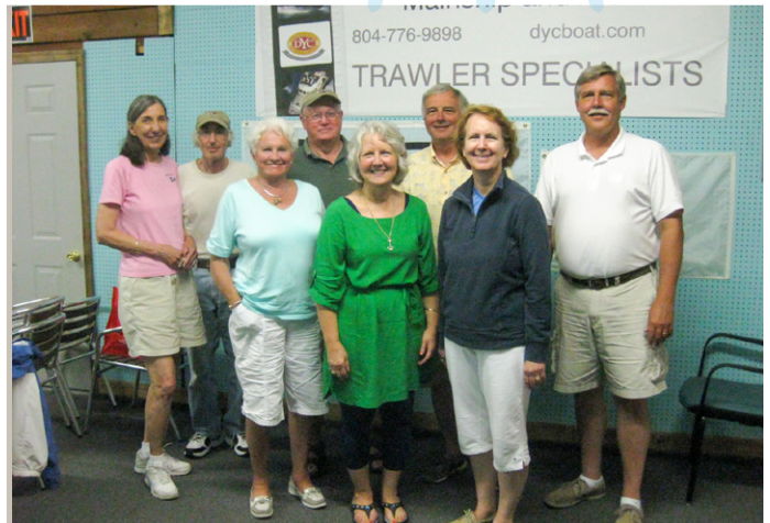
Mainship Owners Enjoy Lunch & Service Q & A Time