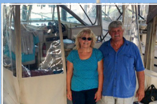
Boats Make People Happy