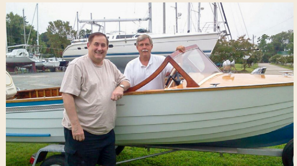
HAPPY BOAT OWNER REMEMBERS HIS DAD'S SORG